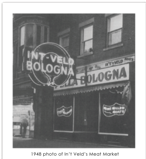
1948 photo of In't Veld's Meat Market