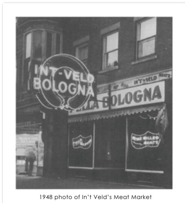
1948 photo of In't Veld's Meat Market